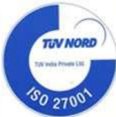
Information Security Management System