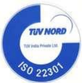
Business Continuity Management System