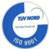
Quality Management System

The Digital Group (T/DG) is a MNC and leading provider of a broad range of Information Technology services having software products across domains like HR, enterprise search, automation testing, telehealth, and more. It was incorporated in 1999 and Head-Quartered at Princeton, US. T/DG is a CMMI 5 level company with 1000+ employees and has IT Service Projects & Products as major business. For more information, visit www.thedigitalgroup.com