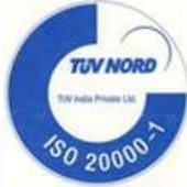
Information Technology Service Management